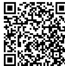
"How You Can Prepare"